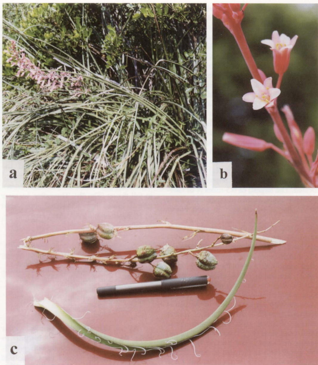
FIG. 2. Hesperaloe engelmannii . a. Habit, Edwards County (Turner 99-367). b. Flowers, Mills County (Turner s. n.). c. H. parviflora , fruiting racemes and longest leaf from plant shown in Fig. 1c.

One Mile Canyon), 28 May 1999, B. L. Turner 99-69 (TEX).