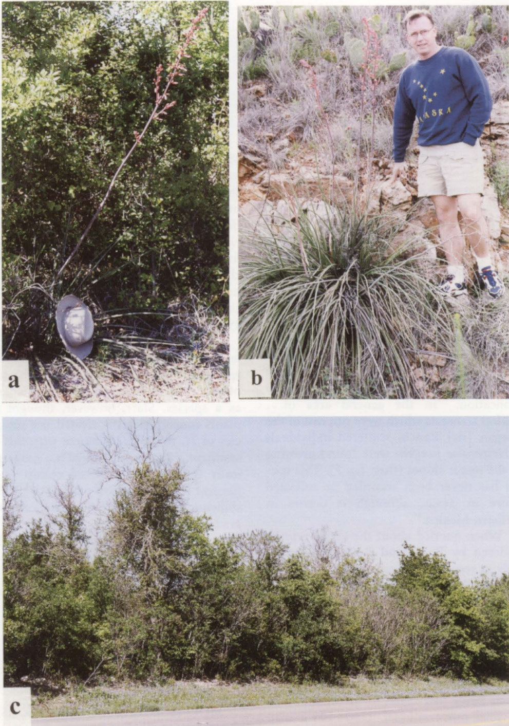
FIG. 3. a. Hesperaloe engelmannii , Mills County, one of the 15–30 plants found growing beneath the trees at the site shown in Fig. 3c. b. Individual of H. engelmannii from San Saba County, along with junior author. c. Roadside habitat of 15–30 plants of H. engelmannii , one of these shown in 3a.